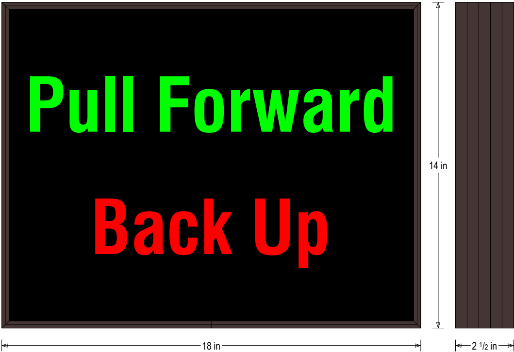
Sample Display Options

NOTE: Sign image may not exactly represent the finished product. For illustration purposes only.