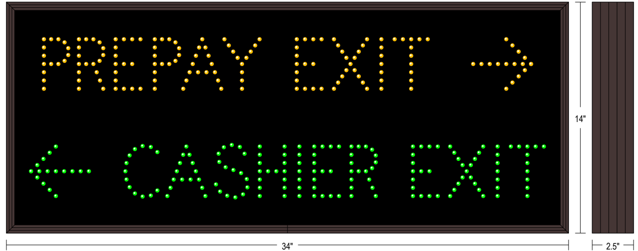
Sample Display Options

NOTE: Sign image may not exactly represent the finished product. For illustration purposes only.