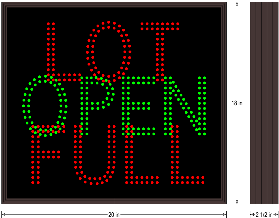
Sample Display Options

NOTE: Sign image may not exactly represent the finished product. For illustration purposes only.