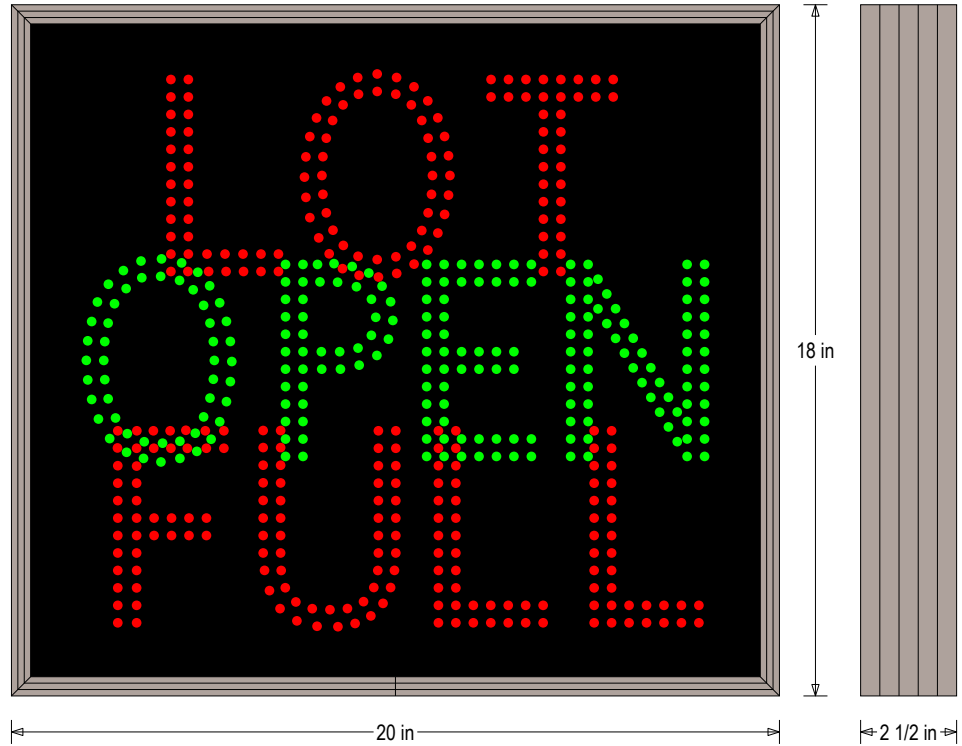
Sample Display Options

NOTE: Sign image may not exactly represent the finished product. For illustration purposes only.