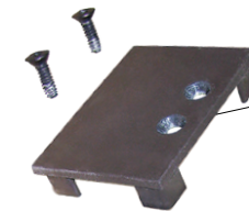
Post Cap (Screws to top of post.)