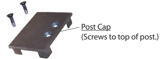
Post Cap (Screws to top of post.)