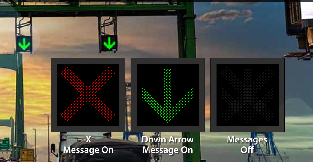
X Message On