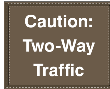
SIDE B VIEW