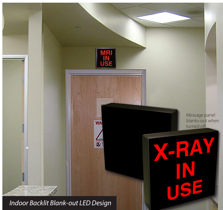
Indoor Backlit Blank-out LED Design