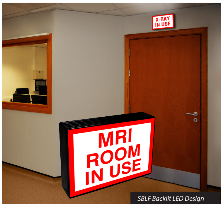
SBLF Backlit LED Design