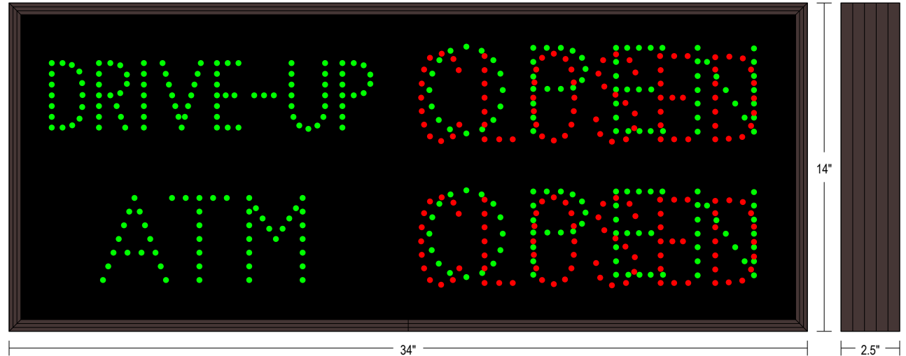
Sample Display Options

NOTE: Sign image may not exactly represent the finished product. For illustration purposes only.