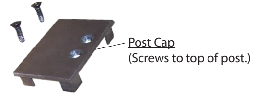
Post Cap (Screws to top of post.)