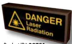
Product ID# 38791 DANGER Laser Radiation w/ Laser Symbol SBL Series 7"×18"

Any of our signs can be produced in a double-faced cabinet with a sign message on both sides. Call for a quote today!