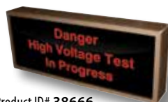
Product ID# 38666 Danger High Voltage Test In Progress SBL Series 7"×18"