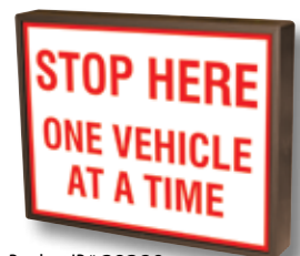
Product ID# 39380 STOP HERE ONE VEHICLE AT A TIME PHXF Series 14"×18"