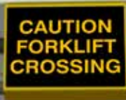
Product ID# 46204 CAUTION FORKLIFT CROSSING PHX Series 14"×18"