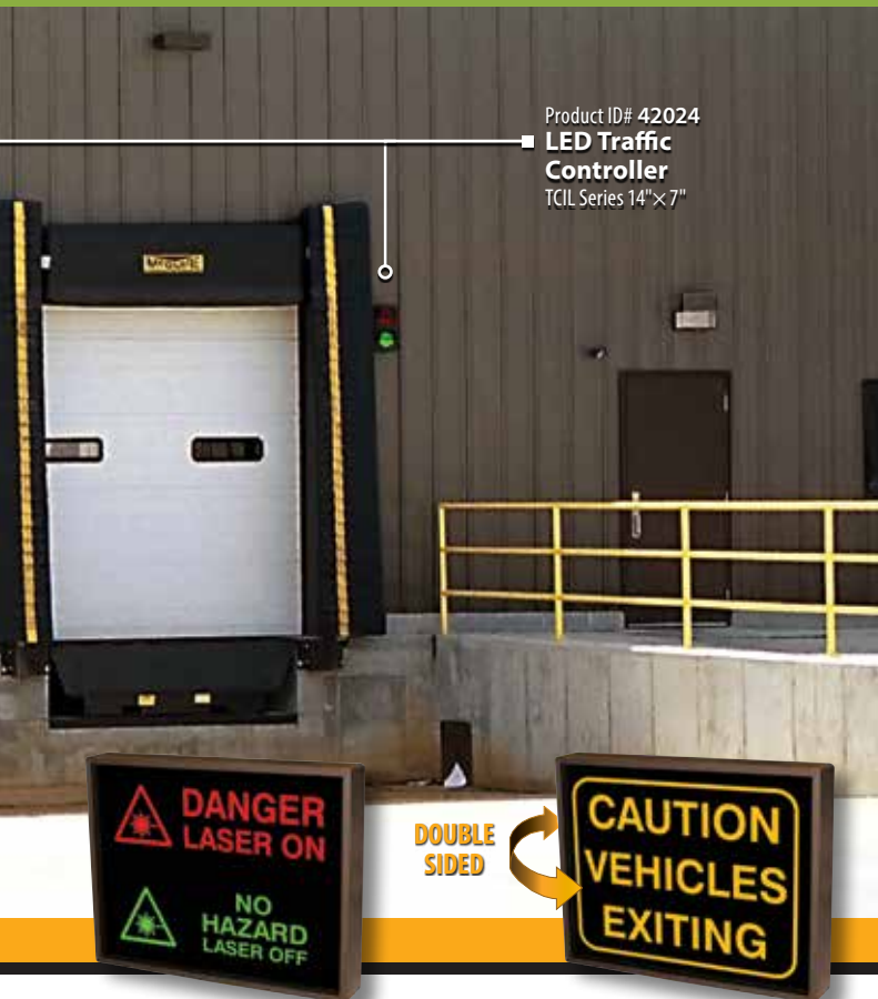
Product ID# 42024 LED Traffic Controller TCIL Series 14"×7"