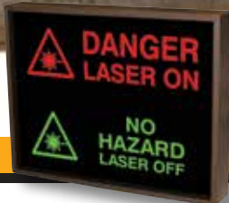
Product ID# 38793 DANGER LASER ON| NO HAZARD LASER OFF w/ Laser Symbol SBL Series 14"×18"