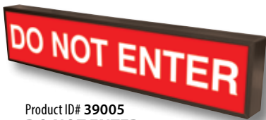
Product ID# 39005 DO NOT ENTER PHXF Series 7"×34"