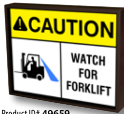
Product ID# 49659 CAUTION WATCH FOR FORKLIFT SBLF Series 14"×18"