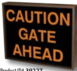
Product ID# 39227 CAUTION GATE AHEAD PHX Series 14"×18"