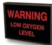
Product ID# 40681 WARNING LOW OXYGEN LEVEL SBL Series 8"×11"