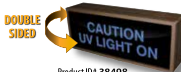
Product ID# 38498 CAUTION UV LIGHT ON (Double Sided) PHX Series 7"×18"