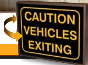
Product ID# 39390 CAUTION VEHICLES EXITING (Double Sided) PHX Series 14"×18"